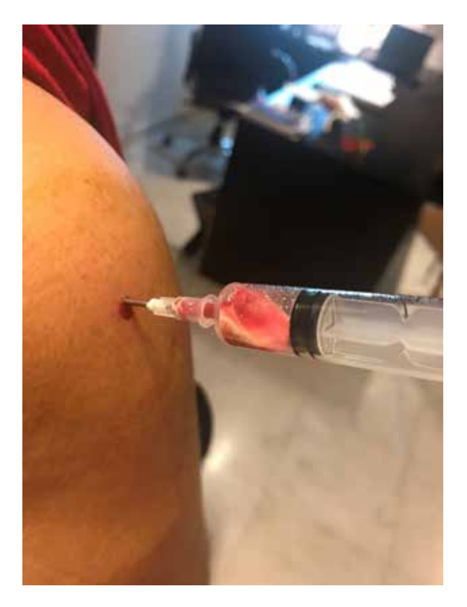
Figure 2. Needle aspiration of soft calcification of infraspinatus tendon during the initial inflammatory phase. The location of the calcification is identified easily above the skin by palpation of a bulky painful inflammatory area or by U/S guidance.

The preferred imaging methods for the identification of calcified tendinitis is plain radiography (Xray) and ultrasound (US), mainly because calcium deposits are easily recognizable in both of the processes. In X-rays, calcium deposits appear to be homogeneous, amorphous, without rough distribution, allowing the differentiation from ectopic osteogenesis [24]. Ultrasound (US) is particularly effective for the diagnosis of calcified tendonitis, as it detects other pathological conditions that co-exist in the area (e.g. tendon injuries) [25]. High resolution ultrasound in combination with color Doppler allows the distinction between the state of formation and the absorption of calcium [26].