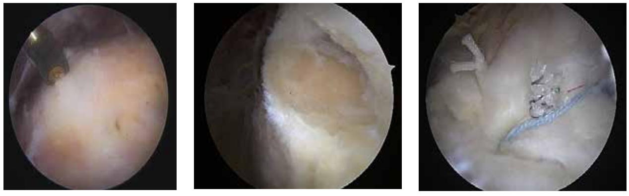
Figure 3. Arthroscopic identification of the calcified tissue (a). Removal of the degenerated tendon (b). Repair of the tendon with re-attachment to its footprint (c)

extracorporeal shock waves therapy (ESWT), PRP (Platelet Rich Plasma), ultrasound-guided needling (UGN) and Surgical Treatment [28].