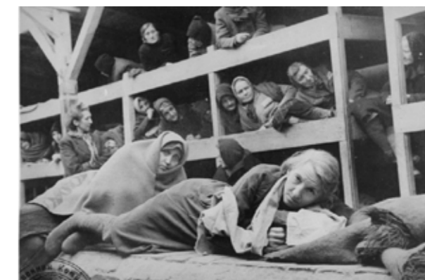
Figure 2. The Silence of God at Auschwitz

Intellectuals and people of letters have expressed