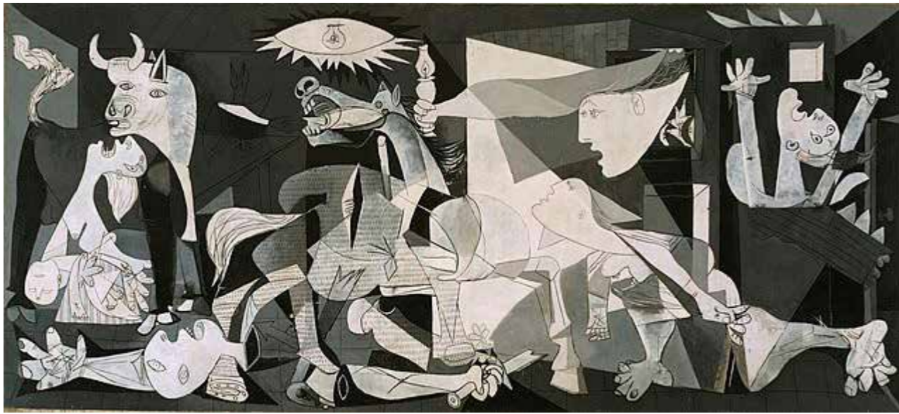
Figure 3. Picasso breaks his silence by painting Guernica .