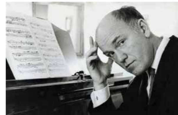
Figure 4. Sviatoslav Richter made good use of absence of sound in his performances

A vascular episode, which affects the left hemisphere of the brain, leads to aphasia, as it disturbs Wernicke’s centre in the brain. Patients in intensive care units who are in coma or suppression unknowingly experience the same situation.