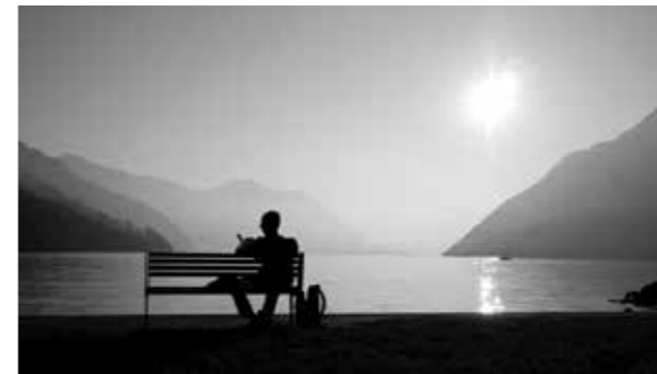
Figure 1. Introverts are treated as suspicious

Nowadays, when our discourse has degraded to all sorts of vulgarity, falsehood, swear and cursing, silence has something to say. In times that we are