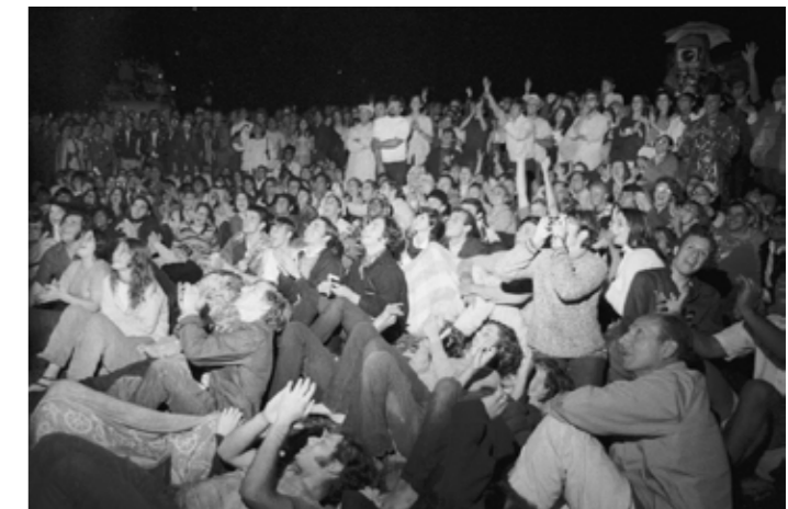
Figure 5. Those that watched the launch of Apollo 11 witnessed a unique event.

Music has mimicked nature and has added its silences in the form of musical pauses -yet another element in its long list of virtues. In symphonic works, in times when some instruments fall silent,