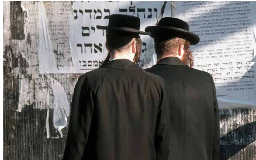
Figure 6. A Hebrew proverb defines five steps of knowledge.

Lloyd were emblematic in this genre, which gave us unforgettable moments of sheer entertainment. The impact of silent dramatization continues to move audiences in cinema, the so-called “seventh art”, even today.